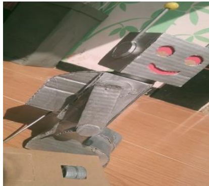
Figure 1. Media Robot Danbo

more fun. In learning mathematics, not only the learning model is used but learning media also needs to be given to students to build their own knowledge. Therefore, suitable media is needed in learning mathematics. Researchers try to provide alternative solutions to deal with the problems faced by students in understanding the volume material of cuboid cubes by applying the use of robot danbo media. Robot danbo media is a learning medium that can be used in mathematics learning, especially in the material for the volume of cubes and blocks. The robot danbo media resembles a danbo doll. Danbo is short for danboard, made from cardboard board (cardboard). This doll is the creation of Azuma Kiyohiko, a comic artist for the Yotsuba manga series. This doll is very unique, namely an action figure with a human-like appearance. Danbo is very popular because danbo can be moved hands, head and feet so that it can be formed with a variety of unique styles. The danbo robot form as shown below.