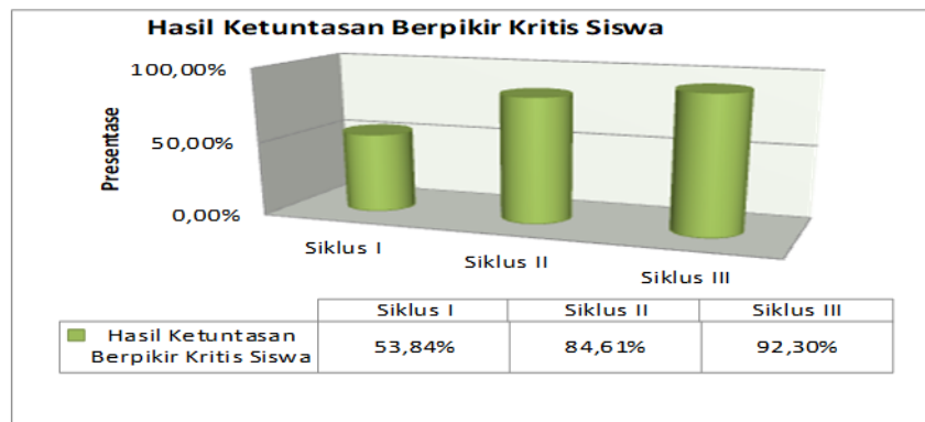
Figure 2. Results of Increasing Students' Critical Thinking

percentage of student success in thematic learning of theme 7 technology development sub-theme 4 transportation technology material.