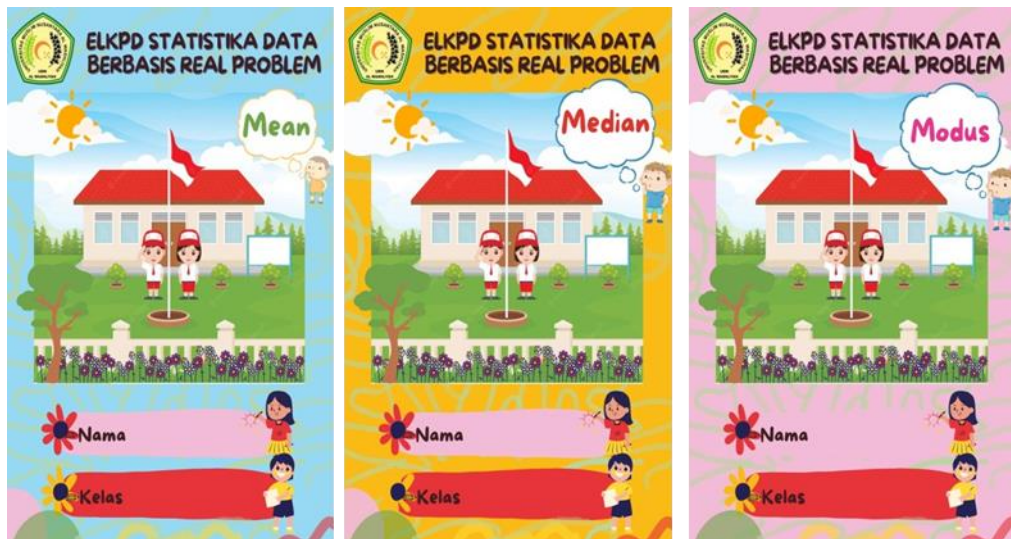
Figure 1. Cover display of e-LKPD

Furthermore, a template for the contents of the e-LKPD is made by displaying instructions for filling out the e-LKPD and then proceeding with displaying the basic competencies, indicators and learning objectives. e-LKPD followed by the stages in accordance with the stages of the Real Problem model . The display of instructions for filling out and basic competencies on the e-LKPD is shown in Figure 2.