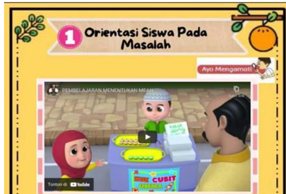
Figure 3. Stage of Student Orientation on Problems

orientation to problems, organizing students to learn, guiding individual investigations, developing and presenting data results, analyzing and evaluating problem solving processes. The display of student orientation stages on the problem is shown in Figure 3 .