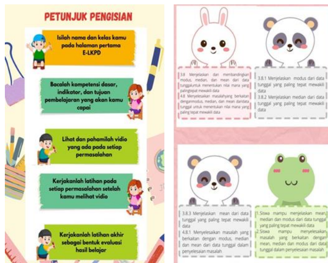
Figure 2. Display of Instructions for Filling in and Basic Competencies in e-LKPD

Furthermore, a template for the contents of the e-LKPD is made by displaying instructions for filling out the e-LKPD and then proceeding with displaying the basic competencies, indicators and learning objectives. e-LKPD followed by the stages in accordance with the stages of the Real Problem model . The display of instructions for filling out and basic competencies on the e-LKPD is shown in Figure 2.