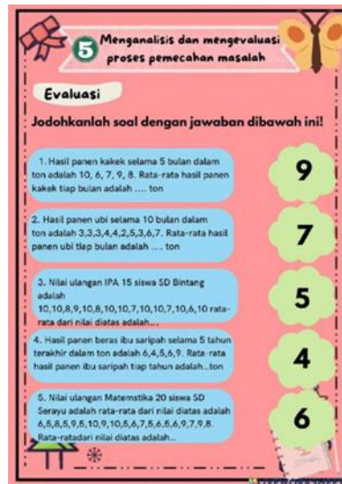
Figure 7. Stage of Analyzing and Presenting Data Results

The last stage in the Real Problem model in e-LKPD is the stage of analyzing and evaluating the problem solving process. This stage contains five evaluation questions that will be done by students. The questions presented can be answered by calculating them in advance as in the previous stages, then students can match the question boxes with the available answer boxes. The display of the stages of developing and presenting the data results is shown in Figure 7 .