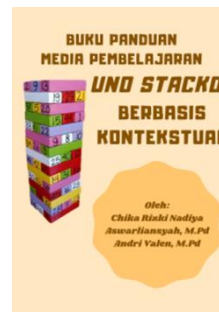
Figure 4. Guidebook