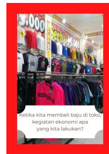
Figure 2. Uno Card

c) The dice have a different color on each side. The color of the dice remains the same as that of the Uno blocks and cards. The dice serve as a guide in picking blocks and uno cards.