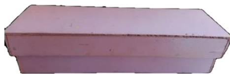
Figure 5. Box Uno Stacko