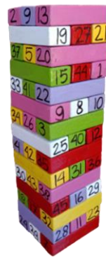
Figure 1. Stacko Blocks

b) Uno cards are colored cards that contain a picture and one question. The color on the card is the same as the color on the block. There are 50 cards in total.