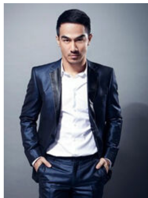
Figure 1. Portrait of Joe Taslim

Joe Taslim is the actor who played the role of Jaka in the film "The Raid." The film "The Raid" is an original Indonesian martial arts film. Not only in Indonesia, but he has also acted in foreign films around the world, including Fast & Furious 6 (2016), Star Trek Beyond (2016), and Mortal Kombat. Not limited to movie screens, Joe Taslim has also been the cover model for several magazines, such as "Augustman," "Man's Folio," and