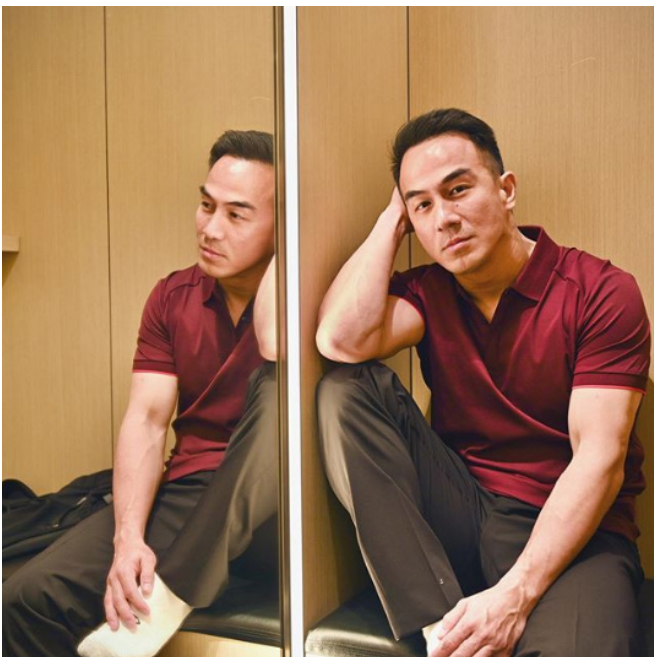
Figure 4. Post on 27 February 2020

give more meaning. For example, Figure 3, like most of Joe Taslim's posts, is dominated by clothing choices with dark colours. The clothing choices of black, brown, and several other dark colours in Joe Taslim's post are shown not only in Figure 3 but also in Figure 4.