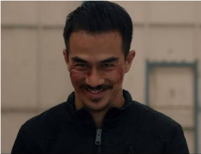
Figure 3. Post on 27 February 2020

give more meaning. For example, Figure 3, like most of Joe Taslim's posts, is dominated by clothing choices with dark colours. The clothing choices of black, brown, and several other dark colours in Joe Taslim's post are shown not only in Figure 3 but also in Figure 4.