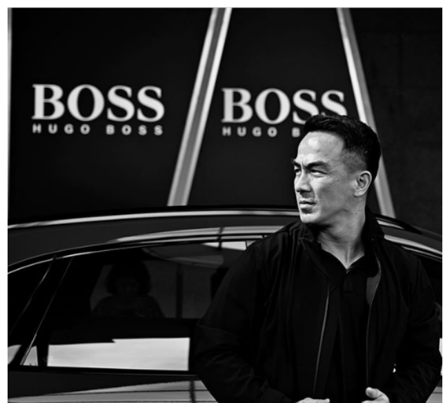
Figure 5. Post on 26 February 2020

The body, in both men and women, has undergone a significant disciplinary process. The masculine impression on men has shifted along with the times that also present men representations of the modern era. As an action actor who is known for his macho appearance, of course, Joe Taslim is a magnet for men who want to look attractive but still