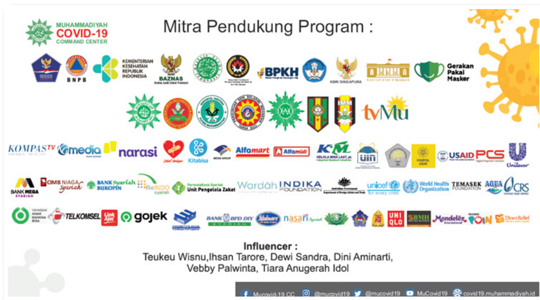
Figure 1. The Collaboration Partnership of Muhammadiyah and other institutions

other institutions in handling COVID-19 pandemic can be seen in figure 1 (MCCC, 2020b).