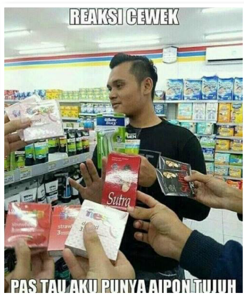
Figure 1. "Girls' Reaction"

Harassment of women today can not only happen in the real world. On the Internet, women are also often mistreated. Penny (2013) even believes that there is no good space for women, even the Internet, which offers freedom. Indeed, content on the Internet often produces symbolic violence through hateful words, images, and communications with racist or sexist backgrounds – cyber sexism (Heitmeyer et al., 2005). On the Internet, for example, we often find memes that harass women, such as Figure 1 below: