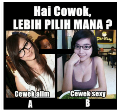
Figure 4. Choice of Girls

These memes become an essential factor in understanding the behavior of cyber sexism as an attempt to dominate patriarchal