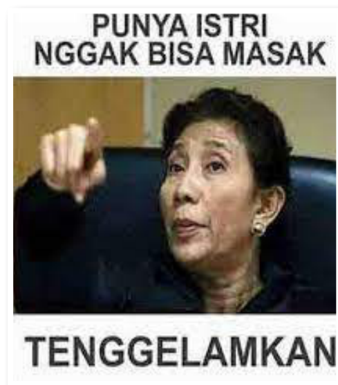
Figure 3. Domestication

and behaviors that reaffirm dominant gender norms as seen in Figure 3: