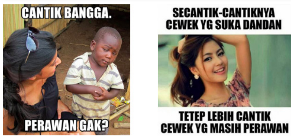
Figure 5. Virginity

One of the hegemonic ways of thinking created by patriarchal culture is the myth of virginity that continues to be produced, as seen in Figure 5: