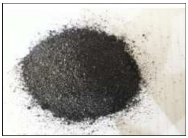
Figure 1. Sand Casting Waste Magnetization Test

next characterization test because the waste is in the form of powder which can be continued in XRD and XRF testing without the need for special treatment so that XRD and XRF testing can be carried out.