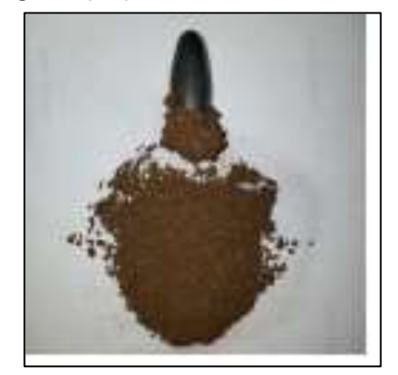
Figure 2. Magnetization Test of Sand Casting Waste

After carrying out physical identification, then conducting a magnetic test which aims to determine the magnetic properties of the waste. The magnetic test is carried out by bringing the waste magnet closer and then making observations. In Figure 2, it can be seen that the results obtained for sand casting type waste have weak magnetic properties.