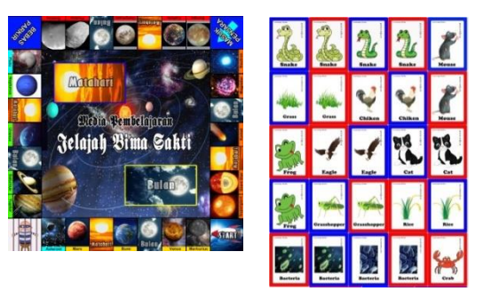
Figure 2. Types of Learning Media Made by Students

Some learning media created by students can be seen in Figure 2.