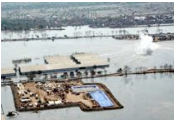
Figure 2. The aerial picture of mud water