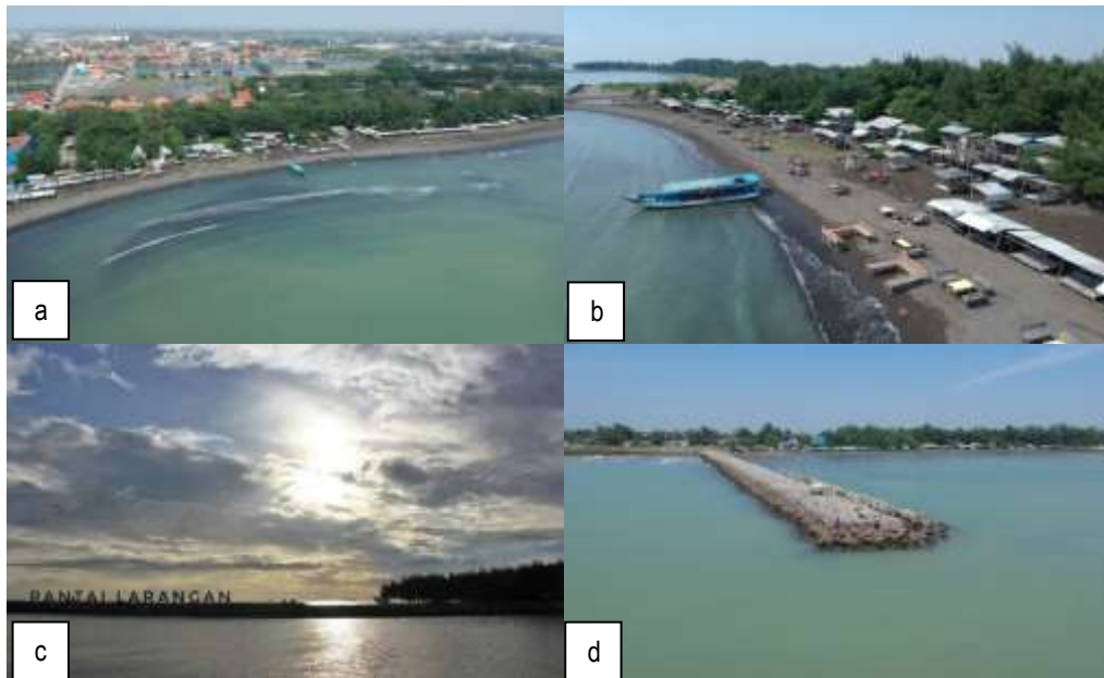
Figure 2. Larangan Beach in Munjungagung Village, Tegal Regency; (a) View Beach from upward direction, (b) View Beach from west direction, (c) Landmark Larangan Beach, (d) Fishing Spot Location

natural panoramas for quite long time. For culinary tourism activities on Larangan Beach , there are dozens of stalls on the beach (DKP Central Java Province, 2019).