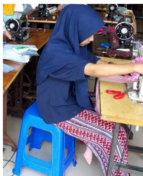
Figure 2. Sewing chairs used by sewing operators

This research was conducted on several sewing machine operators in Sidayu District, Gresik. The time of the research was carried out in February 2021-June 2021. The tool used in this research is Software Inventor 2016. At this time the sewing chair used can be seen in Figure 2. The sewing chair used by sewing operators tends to have no support on the back and Most of them are still in plastic form.