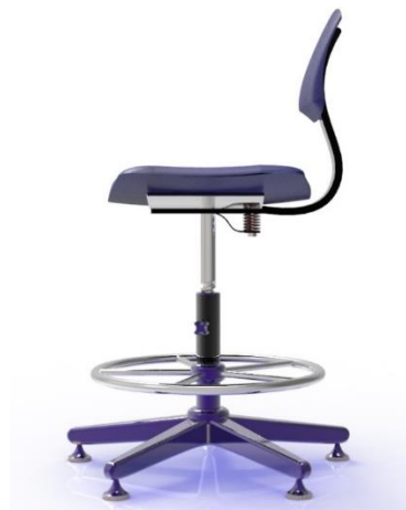
Figure 8. The concept of the seat back

The frame model in this prototype is designed so that the sewing machine operator's seat is comfortable and strong when occupied by the operator and the operator can still concentrate on running the machine, with the seat design on the frame being slightly advanced so that the operator's position can remain upright when operating the sewing machine and when the operator leans his body into the back of the seat the operator can be comfortable because the seat position can follow the operator's movements when sitting. The concept of the back of the chair can be seen in Figure 8.