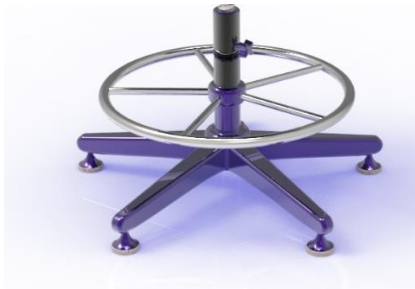
Figure 5. The concept of the chair support

The concept for leg support has been changed significantly, the legs of the chair are not given wheels so that the chair does not move from place to place when the operator operates the sewing machine. There is also an additional footrest. The concept of the seat support base can be seen in Figure 5.