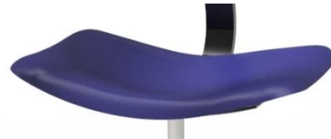
Figure 7. The concept of the seat cushion

The seat mats have been repaired, the first time using foam which if you sit on it often can be thin and make the sewing machine operator uncomfortable when sitting. Replaced with synthetic rubber so that it can adjust the buttocks sitting on the chair. The concept of the seat mat can be seen in Figure 7.