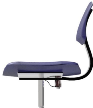
Figure 4. Seat connection concept

The component design for this joint concept is designed simply to be easy to remove and easy to maintain, and the connection is made stronger so that it is not easy for material failure to occur when exposed to the operator's load, this chair frame can rotate to make it easier for the operator to operate the sewing machine, and there is also an additional spring on the connection holder. The concept of seat connection can be seen in Figure 4.