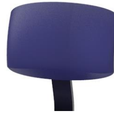
Figure 6. Backrest concept

The concept of the backrest designed is that in general the components needed for the seat back are fewer and easier to manufacture. The shape of the backrest is made simpler and stronger because it is curved according to the operator's back posture. The concept of the chair backrest can be seen in Figure 6.