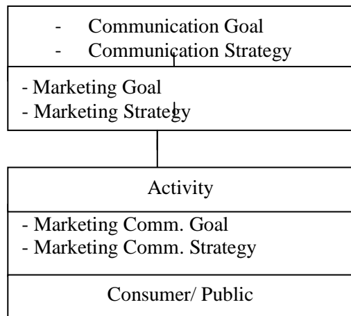
Figure 1 Marketing Communications Model (Bulaeng, 2000)

The success of a strategy depends on how the strategy should be able to adapt the resources in its power to identify any opportunities. Based on analyzes the resources owned by the company and an assessment of market opportunities, a strategy to be in position to establish operational objectives are realistic for the company, such as the model presented in Picture 2.