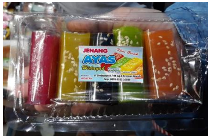
Figure 3 Jenang Ayas in Mica Plastics

a. Dependent Variable: TKP (Customer Purchase Decision) Independent Variables: TL (Food Label) and TK (Food Packaging)