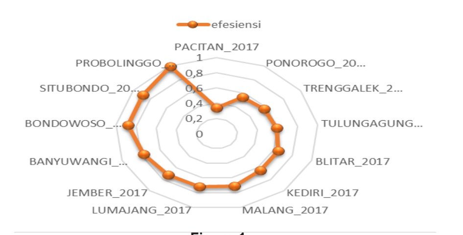
Figure 1 Estimation of Inefficiencies of Food Crop Agriculture in Province Jawa Timur

Figure I explains that the inefficiency area farm food crops on County-District in East Java. In the picture I can see that being a DMU Pacitan district has the least efficient areas (inefesien) and acquisition value under 0.340035 efficiency score score 1. Probolinggo district became an almost DMU efficiently with a score of 0.991713. The occurrence of the DMU inefficiency in the 13th district in East Java in the aggregate can be caused due to the presence of experts the first function of land from agriculture to residential sector and the industrial sector. Both the existence of a number of workforce that continues to increase in agriculture food crops. So that agricultural productivity directly affects food crops (Toma, Pierluigi, et al (2017); Song, Wei (2016) and Giannakis, Elias. et