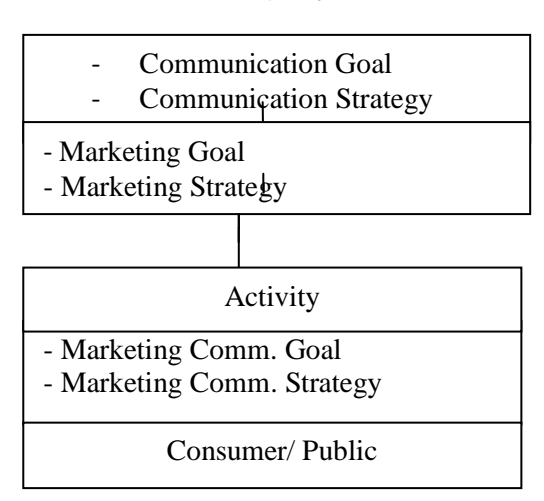
Figure 1 Marketing Communications Model (Bulaeng, 2000)

The success of a strategy depends on how the strategy should be able to adapt the resources in its power to identify any opportunities. Based on analyzes the resources owned by the company and an assessment of market opportunities, a strategy to be in position to establish operational objectives are realistic for the company, such as the model presented in Picture 2.